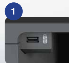
USB direct print*