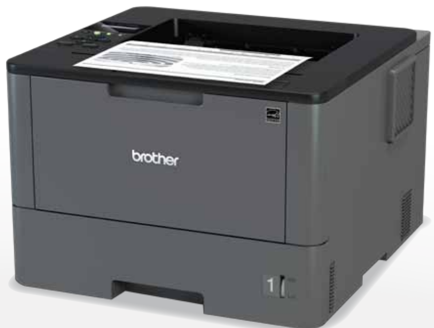
HL - L5100DN

Every business needs a reliable business partner. The new mono laser series helps you maximise print efficiency and minimise costs so you can make the most of your investment.