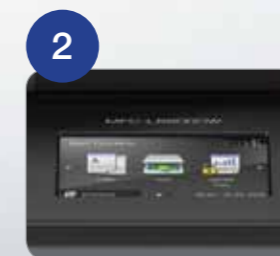
3.7" TFT Colour LCD*